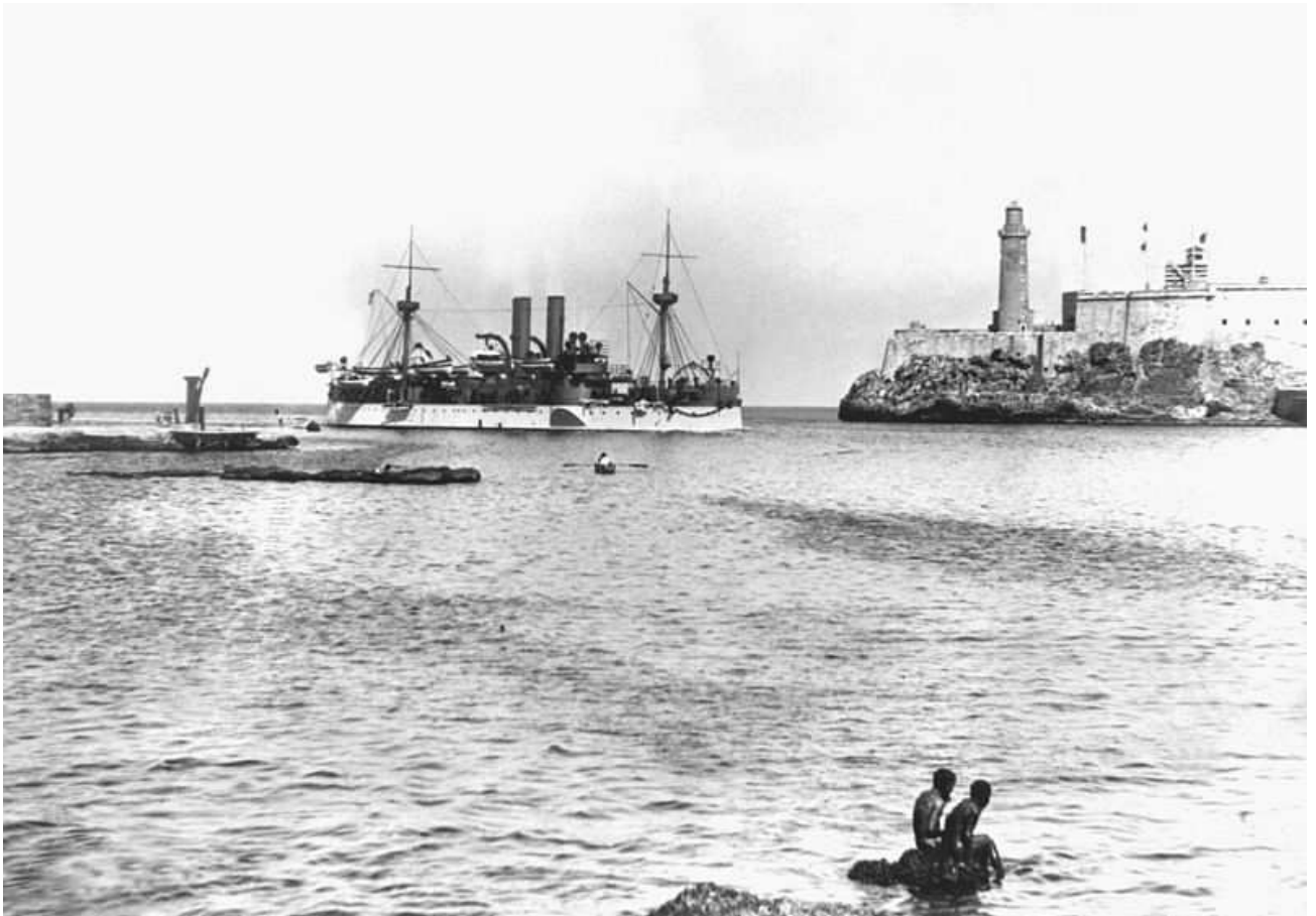
“ USS Maine ” entering the port of La Habana, Cuba, on January 25, 1898.

Three weeks later, the craft unexpectedly exploded.