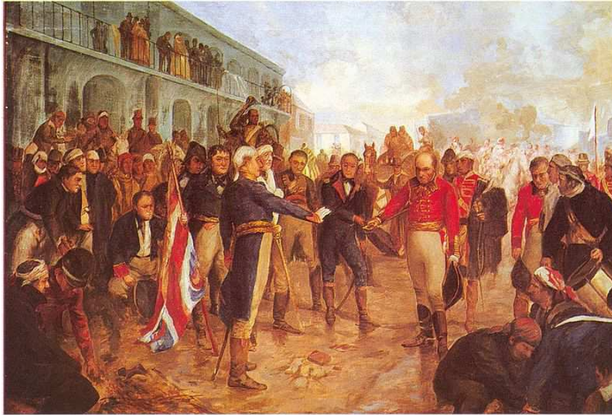
BERCFORD's surrender to DE LINIERS in the First British Invasion of the Río de la Plata in 1806.

Such unusual collection of misdeeds, outrages and crimes cannot derived but from a putrefied swamp. It is about the “ matrix ” of Great Britain's “ dark side ”. From this evil spring emanates fiercely the poison that, as well as causing innumerable outrages and hurling undeserved insults to many nations, ended up soaking the kingdom itself, corrupting it to the point of threatening its own subsistence. Yes, “ something smells bad... ” in Great Britain itself.