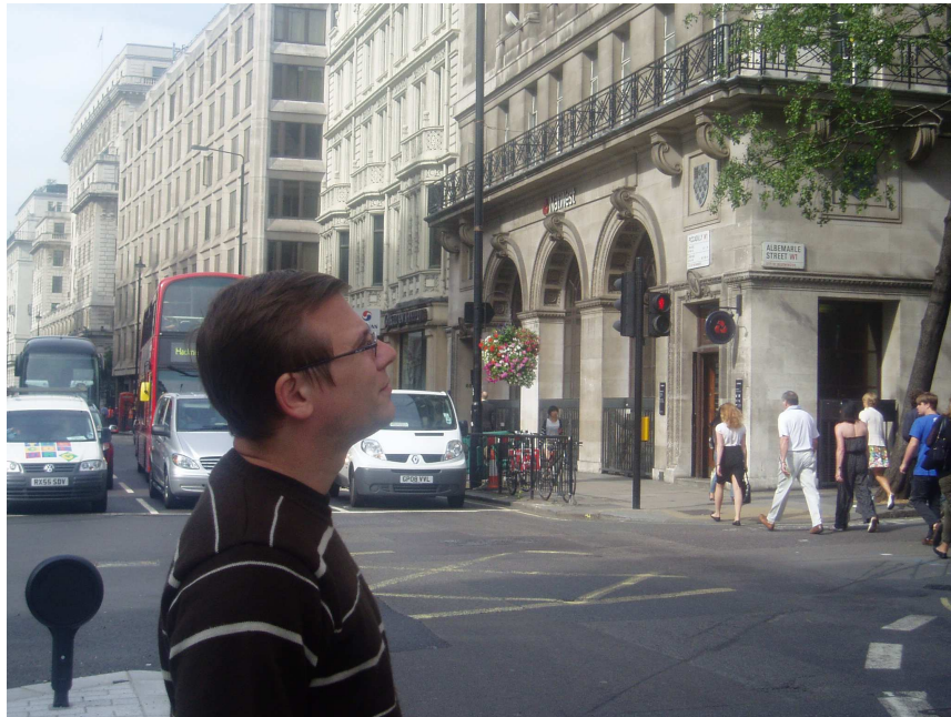
The author in London (August 2011).

How disappointing was to notice that that imperial capital, once magnificent, in the last years has become a messy, strikingly dirty and “Babylonian” metropolis. Apparently, there are no longer English living there. Upon moulds genuinely British and, more specifically, English, multicolored and characterless crowds wander about, and they have little or nothing to do with that impressive and historic leading role.