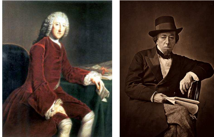
William PITT, “ the Elder ”. Benjamin DISRAELI.

himself ; a hidden power to which, in the 19 th century, Prime Minister Benjamin DISRAELI will again allude in his famous “ Coningsby ”. (2)