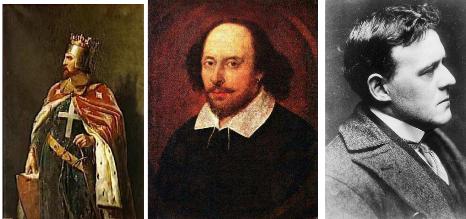
RICHARD I, " Lion Heart ". William SHAKESPEARE. Hilairy BELLOC.

mix of Celts, Romans, Anglo-Saxons and Normans— has operated as the matrix of genuinely brilliant characters.