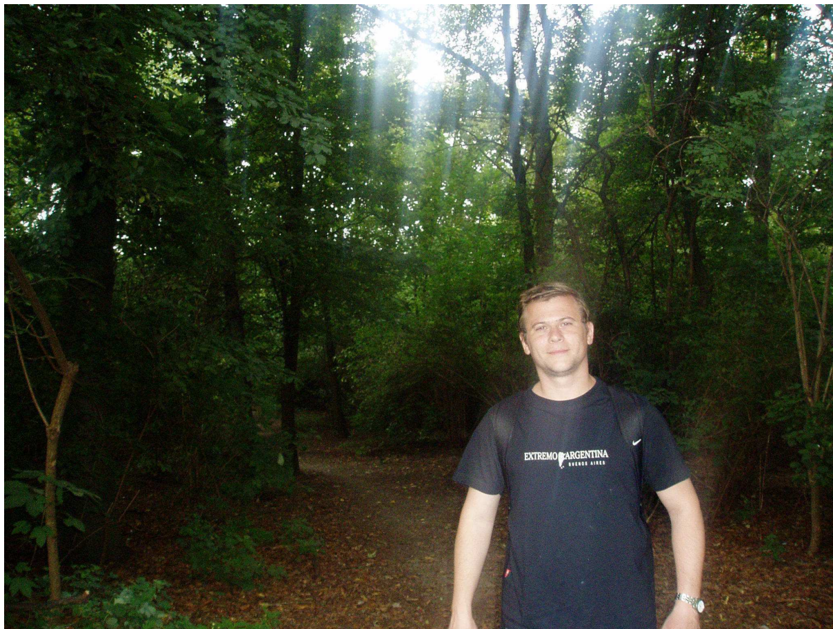
The author in August, 2011.

He wrote many books (" Cuestiones Demológicas ", " Los Grandes Paradigmas Históricos y el Estudio de los Fenómenos Sociales ", " Meditaciones Sociológicas. Confesiones de un Argentino Preocupado ", etc.) and many articles on different subject matters regarding Political Philosophy, Geopolitics, International Politics, Political Law and Constitutional Law. He also gave lectures on said subject matters at the Social Sciences and Law School and the Economic Sciences School at the Pontifical Catholic Argentine University in Rosario, at the Bar Association in Rosario, the Legislative Association of Argentina, etc. In August, 2011, he participated in the meeting between His Holiness Benedict XVI and Young University Professors held at El Escorial (Spain).