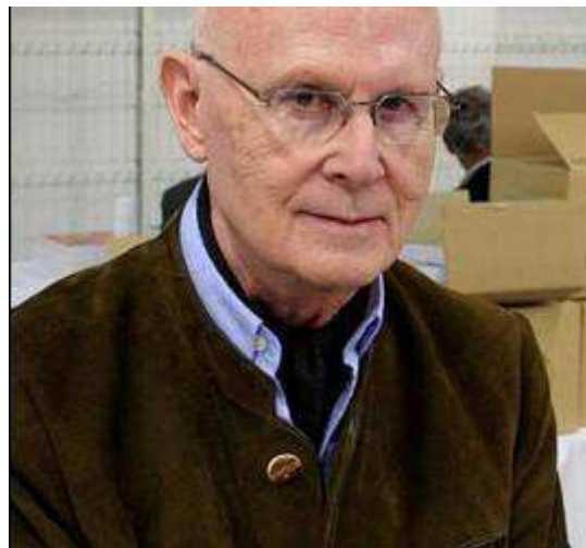
The French historian and writer Dominique VENNER (1935/2013). 5

It is important to add that VENNER, in his book “ Europa y su Destino. De ayer a mañana ”, published in recent years, VENNER had already clearly explained in great detail the fears he had in regard to the future of Europe.