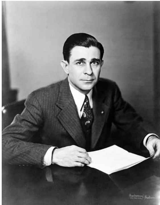
Congressman Thomas G. ABERNETHY.